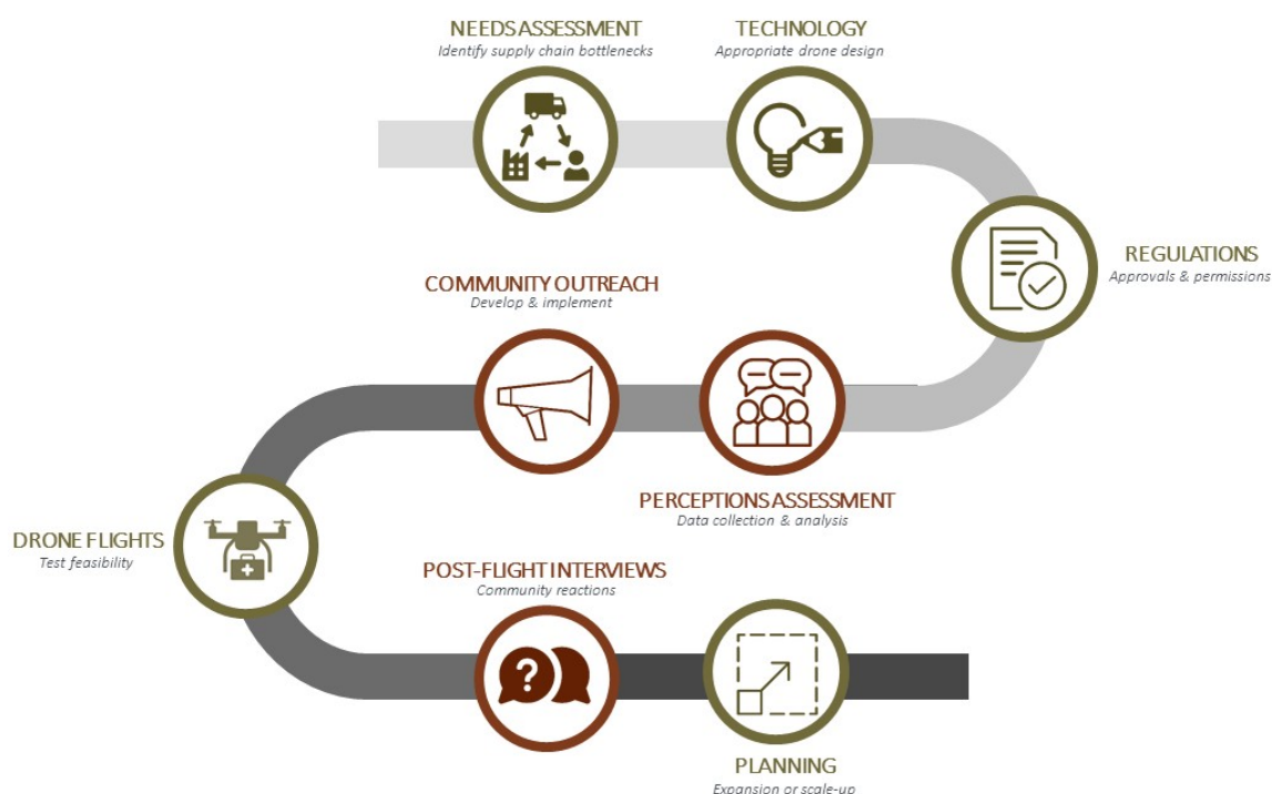
Figure 1. General drone feasibility testing project implementation plan.

Although project implementation varied slightly within each of the four countries, Figure 1 illustrates the general timeline. Community perceptions assessments were conducted before the development and implementation of community outreach, followed by a series of drone test flights. In all four countries, the drones tested were fixed-wing, capable of vertical take-off and landing and battery-powered. Each drone could carry 2–3 kilograms of payload in a temperature-controlled compartment. Drone test flights were planned for a period of one week to one month, depending on the country, and traveled a distance of between 10 and 40 km.